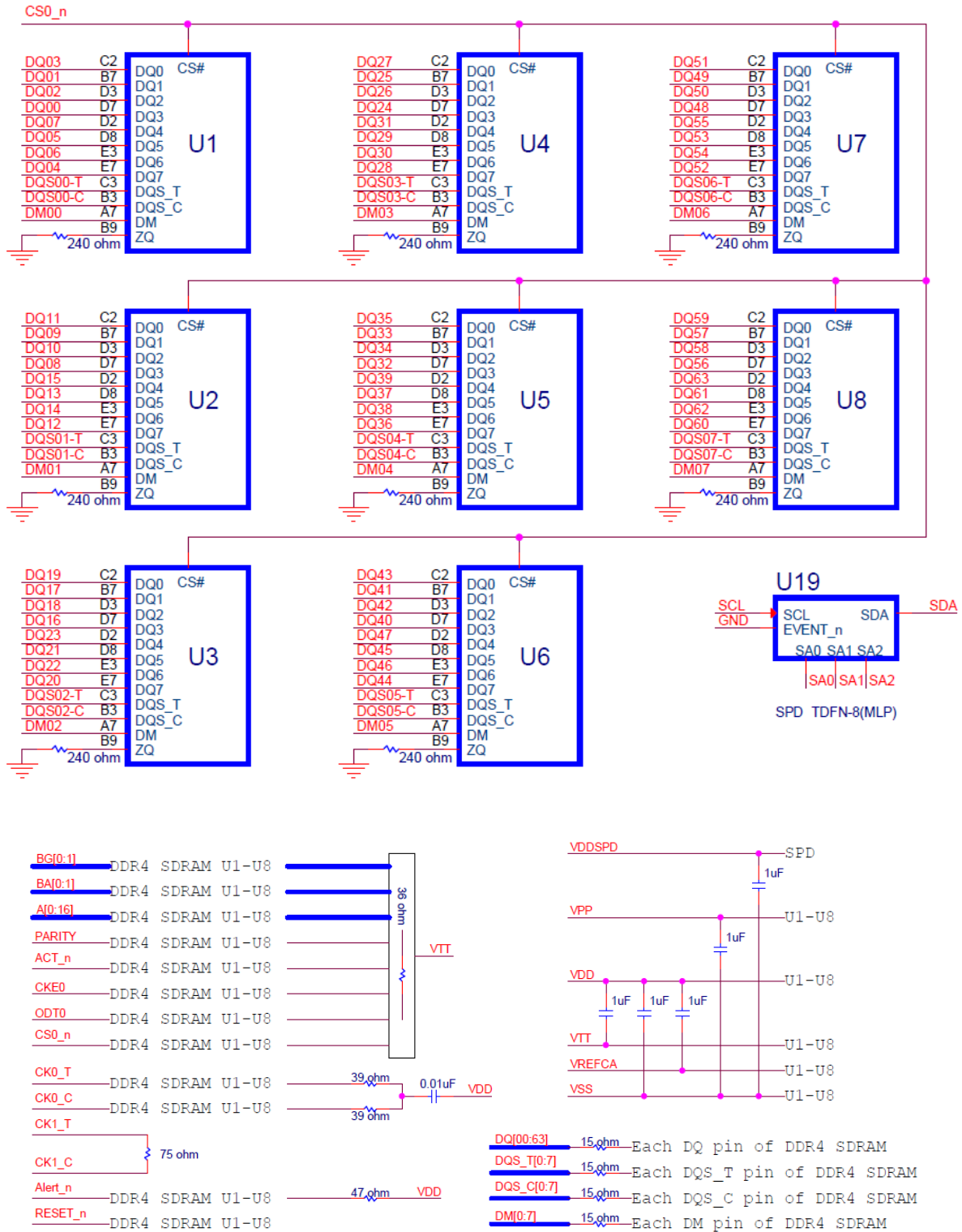
Figure 1 – Function Block Diagram_SCC08GU03G2F1C-32AA