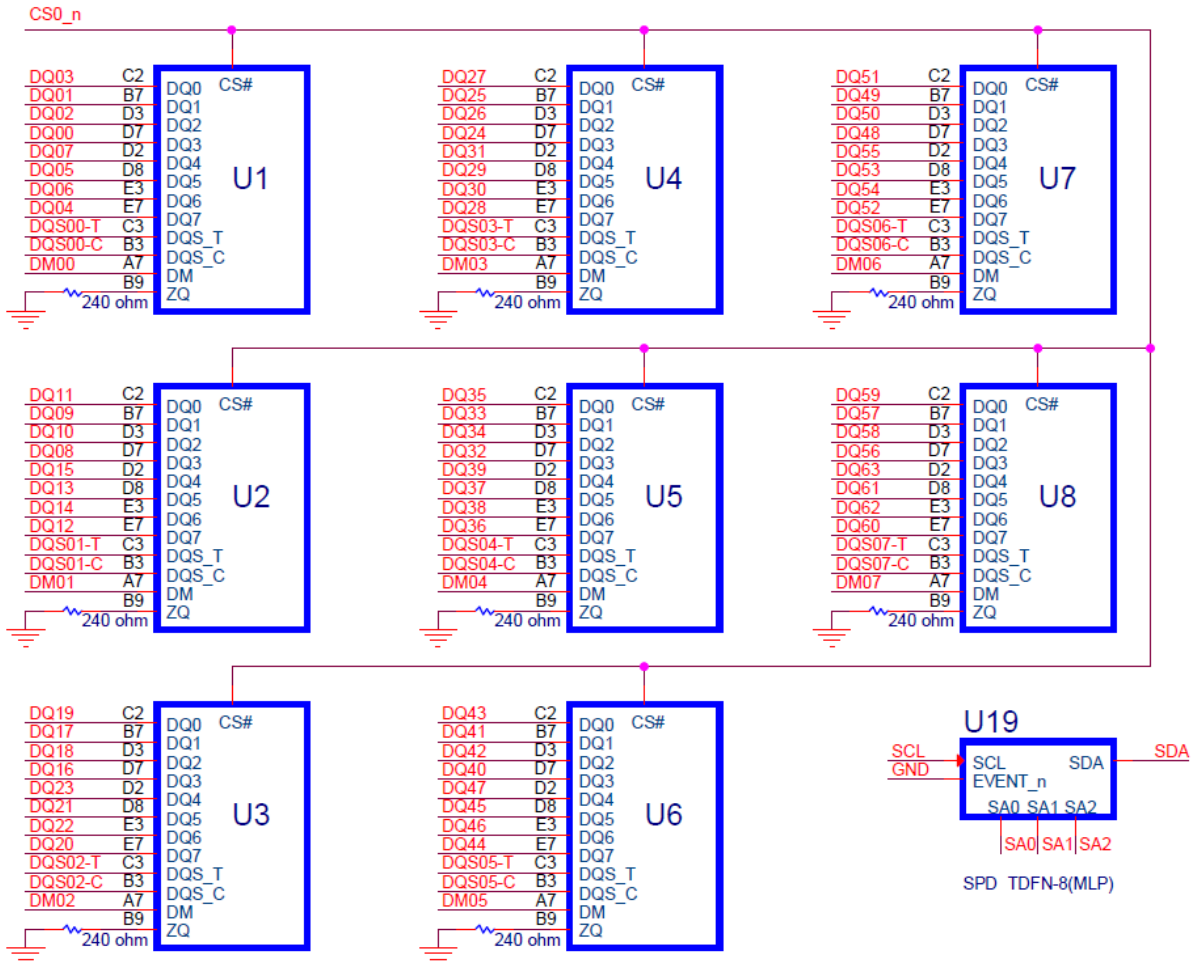
Figure 1 – Function Block Diagram_SCQ08GU03M2F1C-32AA